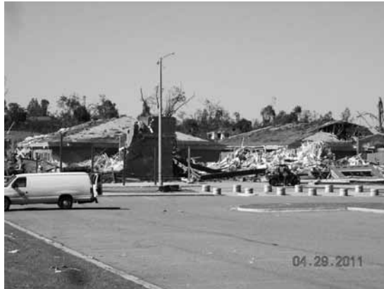
APRIL 27, 2011 TORNADO ALBERTA ELEMENTARY, TUSCALOOSA, ALABAMA

The State Insurance Fund experienced its worse loss year in its history in FY 2011 when a catastrophic tornado outbreak occurred on April 27, 2011. Producing more than 550 claims from 215 locations, reserves quadrupled those of Hurricane Ivan in 2004. Tornadoes caused massive destruction to six K-12 schools, one community college and a state park and badly damaged additional structures at other multiple locations. The State Insurance Fund has excess insurance coverage which responds to occurrence claims exceeding $3,500,000.00.